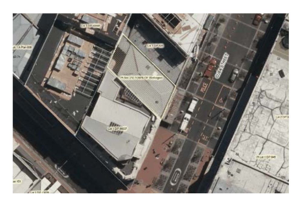
Cityview GIS 2012