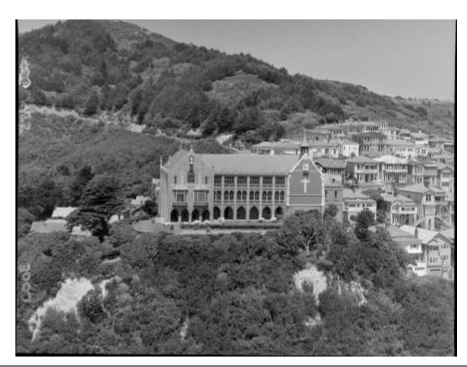
St Gerard's Monastery, Mount Victoria, Wellington. Photograph taken for the Evening Post newspaper of Wellington by an unidentified staff photographer. Ref: EP/1955/3002-F