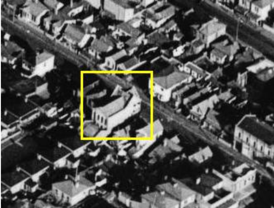
30 Arthur Street, 1934. An aerial view of Wellington. Negatives of the Evening Post newspaper. Ref: 1/2-122291-F. Alexander Turnbull Library, Wellington, New Zealand.