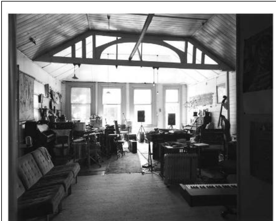
Andrew Ross, accessed September 19 2012, http://www.photospace.co.nz/ross_pages/andrew_ross_43.htm .