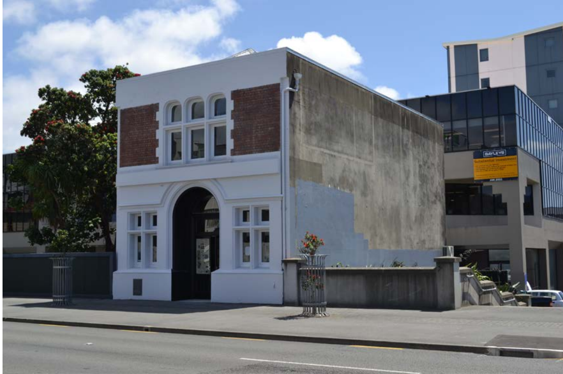
The Boy's Institute