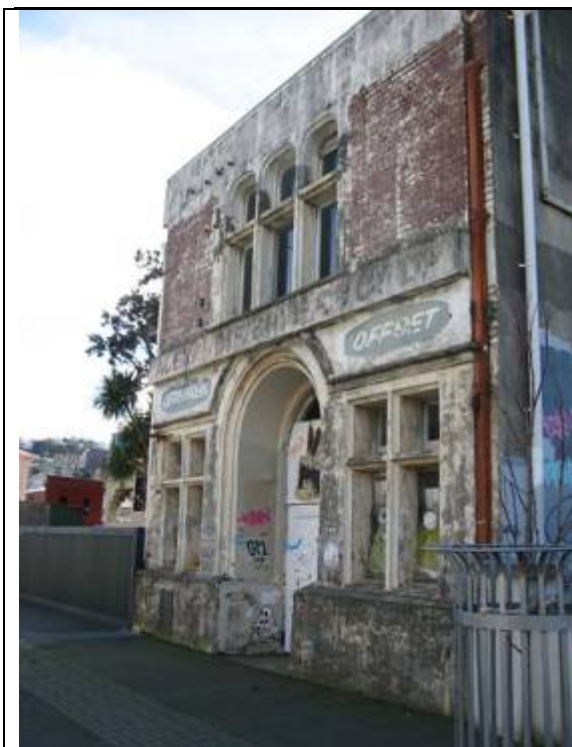
The Boys Institute Building c.2010. 14