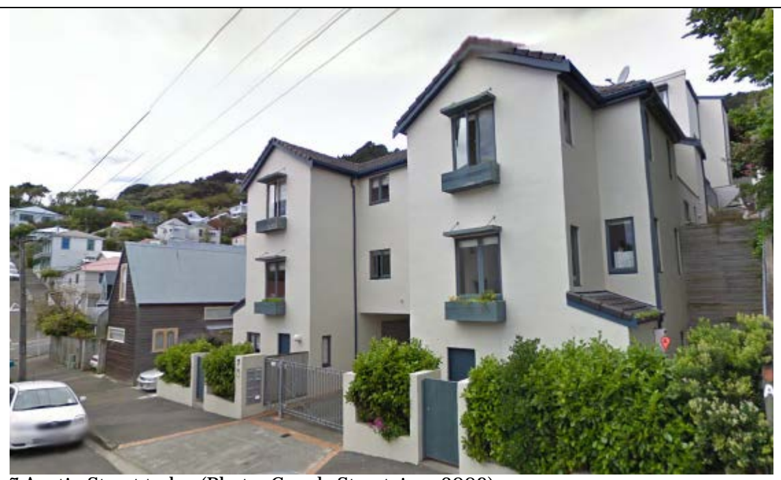
7 Austin Street today