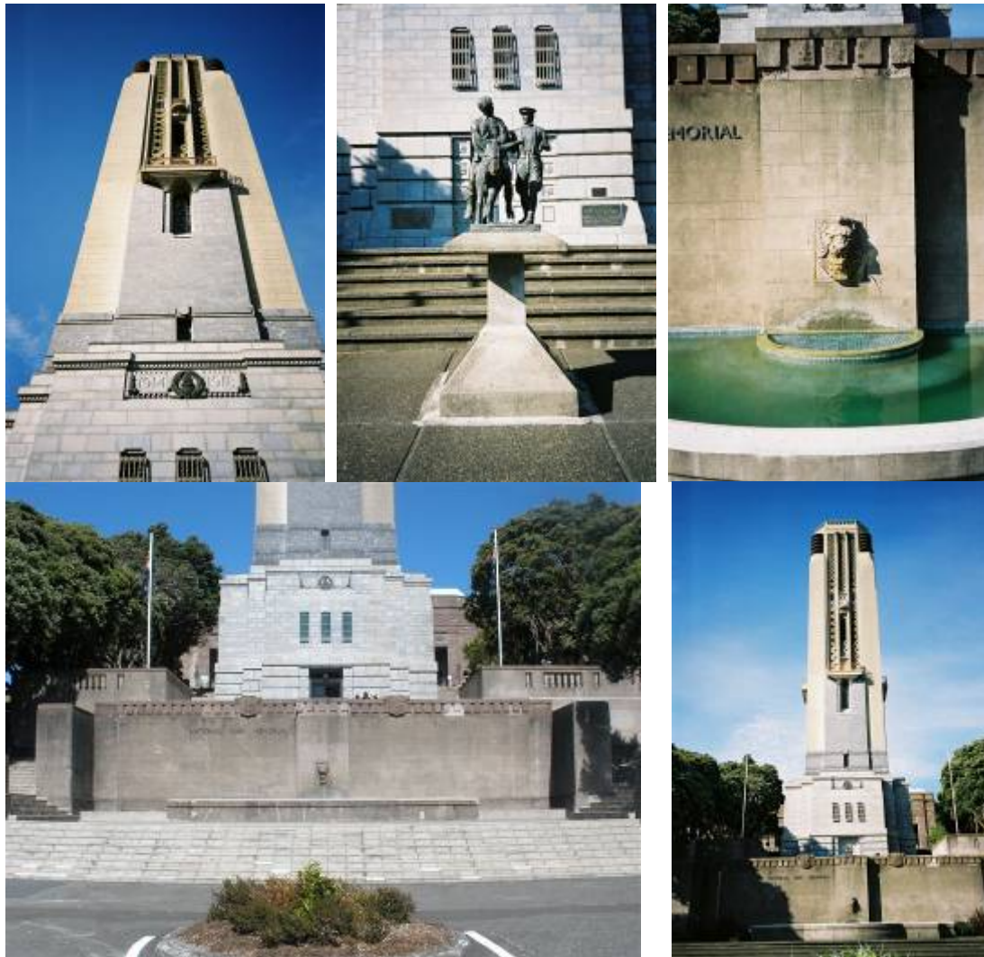
War Memorial and Carillon.