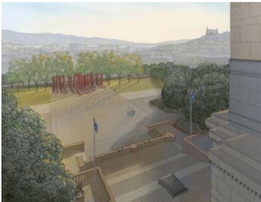
2013 – Concept sketch of the Australian War Memorial as seen from the steps of the War Memorial 9