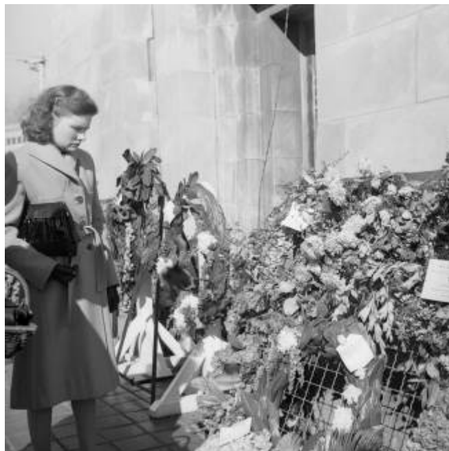
Woman and Anzac Day wreaths, Wellington Cenotaph war memorial, 1945.