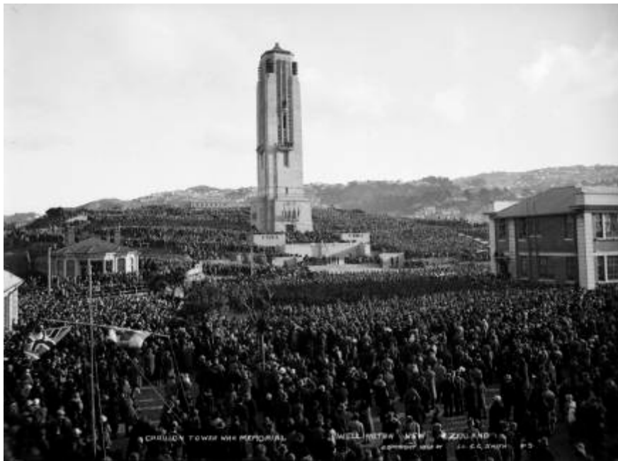
Carillon dedication, 1932.

The area to the north of the Carillon and War Memorial is currently being redeveloped to form the National War Memorial Park. The park will be a large open space and has been designed to suit the commemorative ceremonies planned for the Centenary of the First World War. State Highway 1 will be diverted into a tunnel and the space above ground will be re-configured to form a park with views across the city. The park should be completed in time for the Anzac Day 2015 commemorations. The Carillon is currently scaffolded and is undergoing maintenance and repair work that includes some seismic strengthening of the tower (2013). 7