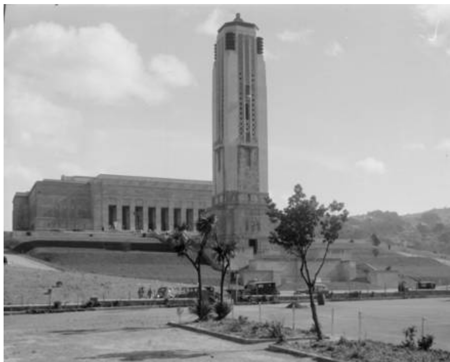
National War Memorial Carillon, Buckle Street, Wellington, 1936.