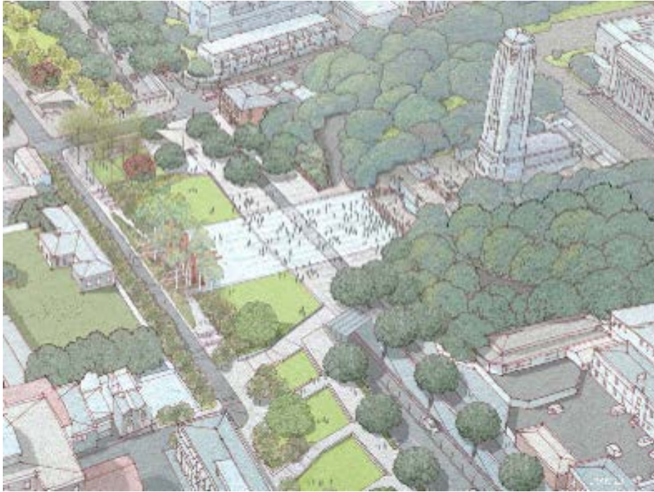
2013 – Concept plan for the National War Memorial Park 8