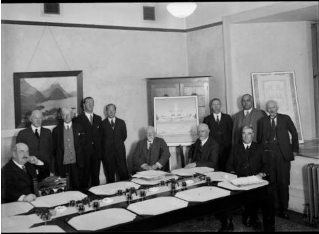
Dominion Museum Committee. Negatives of the Evening Post newspaper. Ref: EP-3876-1/2-G. Alexander Turnbull Library, Wellington, New Zealand, accessed 3/5/2013, http://natlib.govt.nz/records/23252624