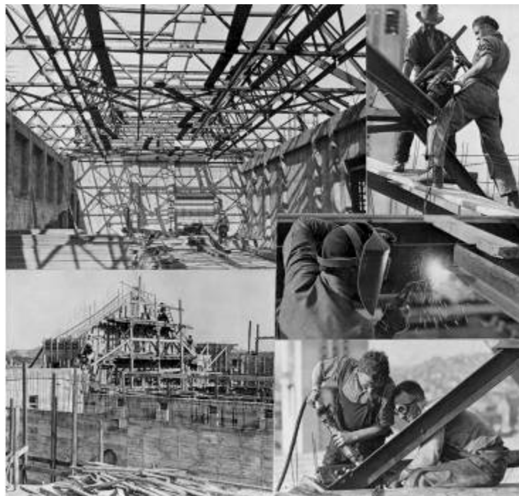
Montage of images showing the Dominion Museum under construction, Buckle Street, Wellington. Ref: 1/4-015181-F.