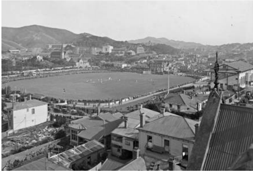
Home of Compassion Crèche (third building from the right, next to the empty section, 1929). Negatives of the Evening Post newspaper. Ref: EP-0654-1/2-G. Alexander Turnbull Library, Wellington, New Zealand.