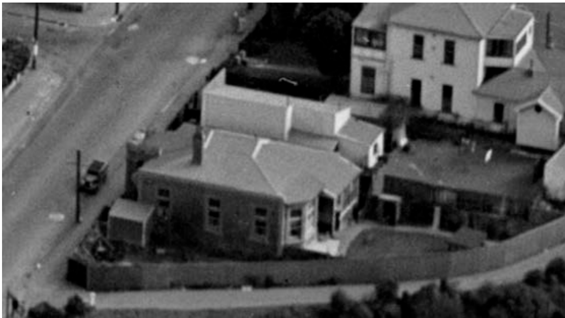
Crèche, 1958. Aerial view of Wellington. Whites Aviation Ltd: Photographs. Ref: WA-47346-G. Alexander Turnbull Library, Wellington, New Zealand.