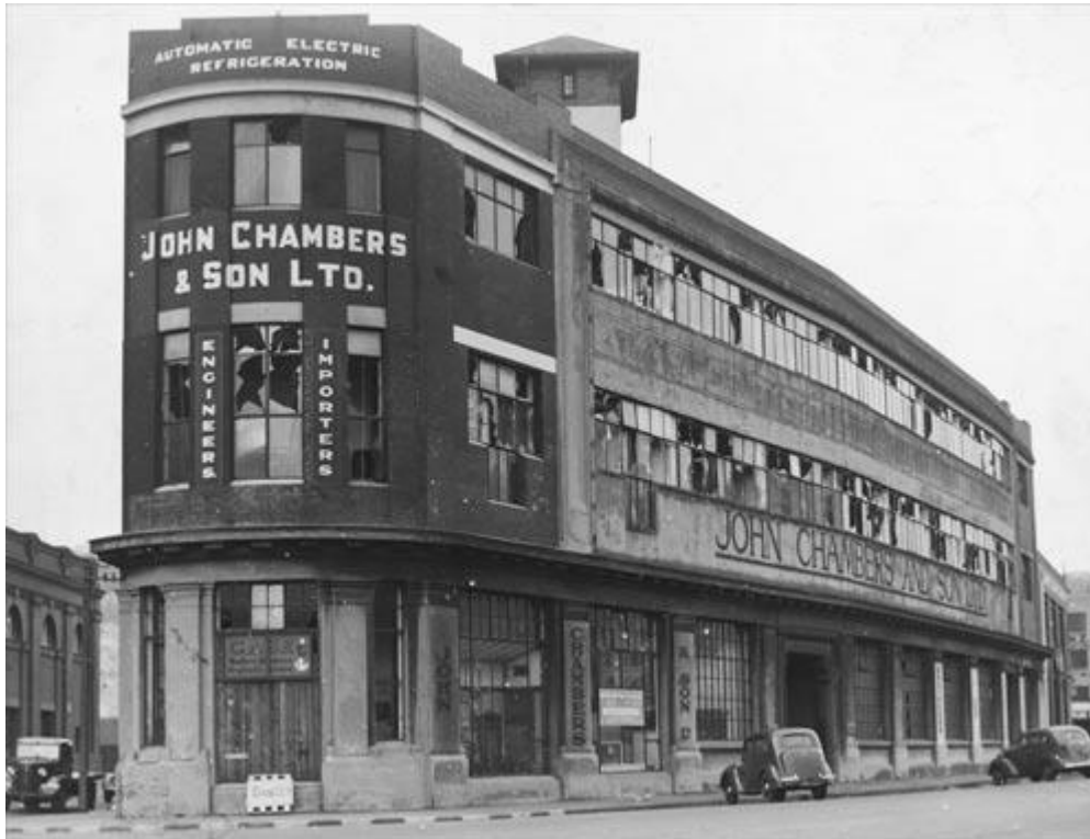
Eileen McSaveney. 'Historic earthquakes - The 1942 Wairarapa earthquakes', Te Ara - the Encyclopedia of New Zealand, updated 21-Sep-12 http://www.TeAra.govt.nz/en/photograph/4515/john-chambers-building-jervois-quay