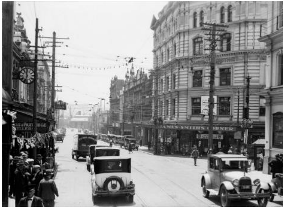
Cuba Street, Wellington.