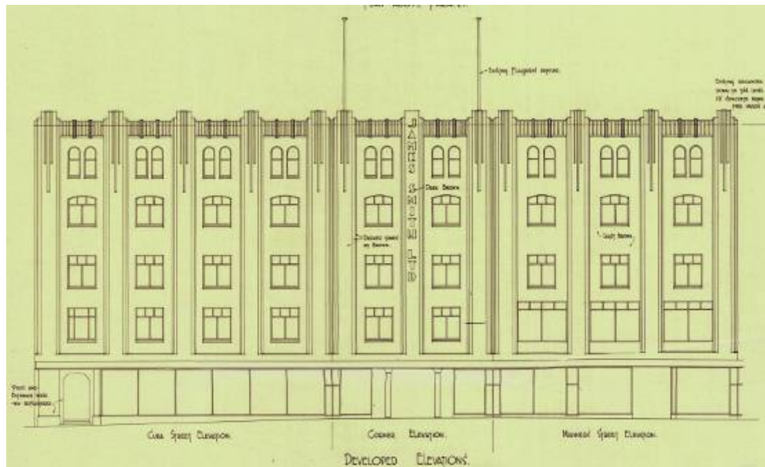
Plans for 1932 Art Deco façade of corner building (WCA 00056:130:B11856)