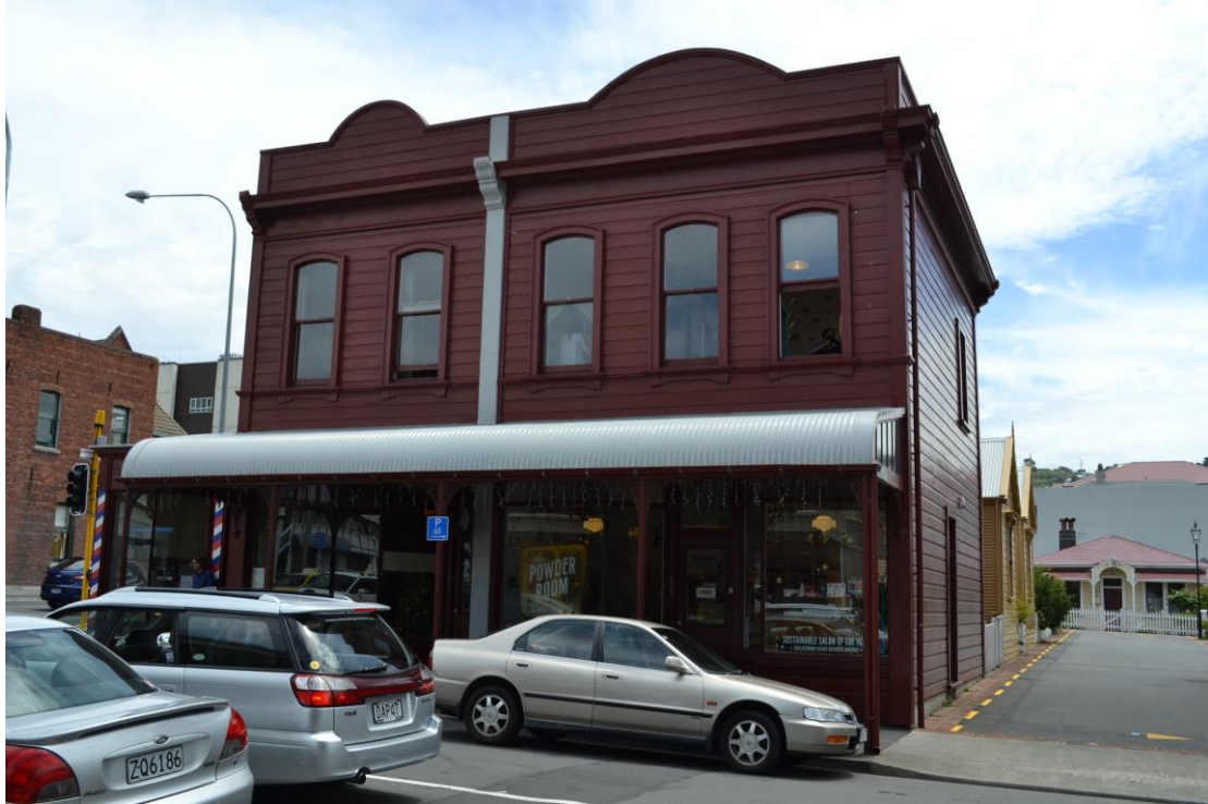
270-272 Cuba Street ( Charles Collins, 2014 )

(Relocated from 289-291 Cuba Street as part of Inner City Bypass Project c.2005-06)