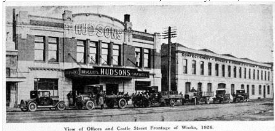
Photo: The Hudson's biscuit factory in Castle Street in 1926, four years later the company joined up with Cadbury Brothers<sup>27</sup>.

May 2009 – Women's Refuge moved into the building. Its community office, previously on Willis Street, moved to the 3<sup>rd</sup> floor. The move was in response to the increasing demand for services, for day to day crisis work and also for programmes.<sup>28</sup> When advertised on the rental market by Ray White the 200m2 space was described as: