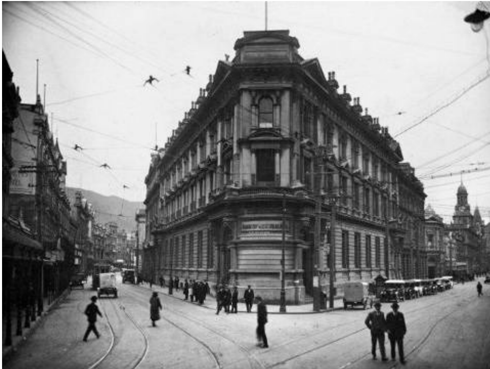
Bank of New Zealand, corner of Lambton and Customhouse Quays, Wellington. Circa 1920s. Original photographic prints and postcards from file print collection, Box 3. Ref: PAColl-5671-21. Alexander Turnbull Library, Wellington, New Zealand. http://natlib.govt.nz/records/23115336

The building accommodated the Wellington branch on the ground floor and the head office on the upper two floors. This arrangement continued until the bank left the building in 1985.