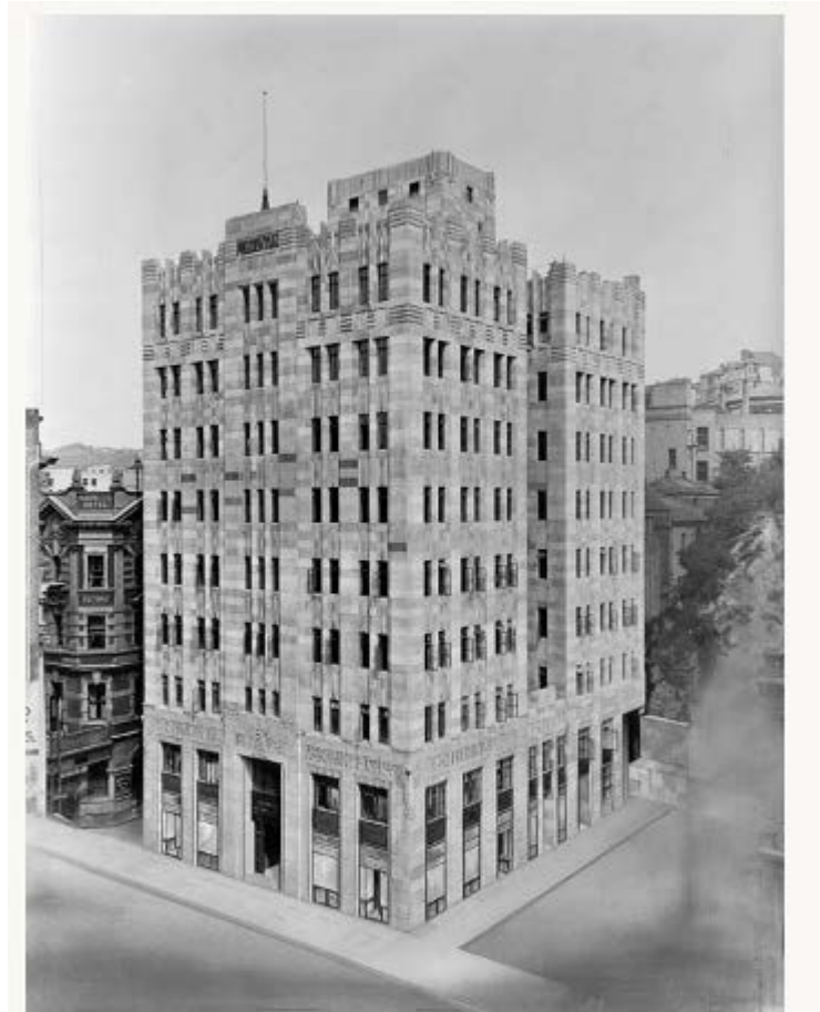
5

also includes a part of the city, a stretch of southern Lambton Quay, that has been permanently settled since 1840. 4