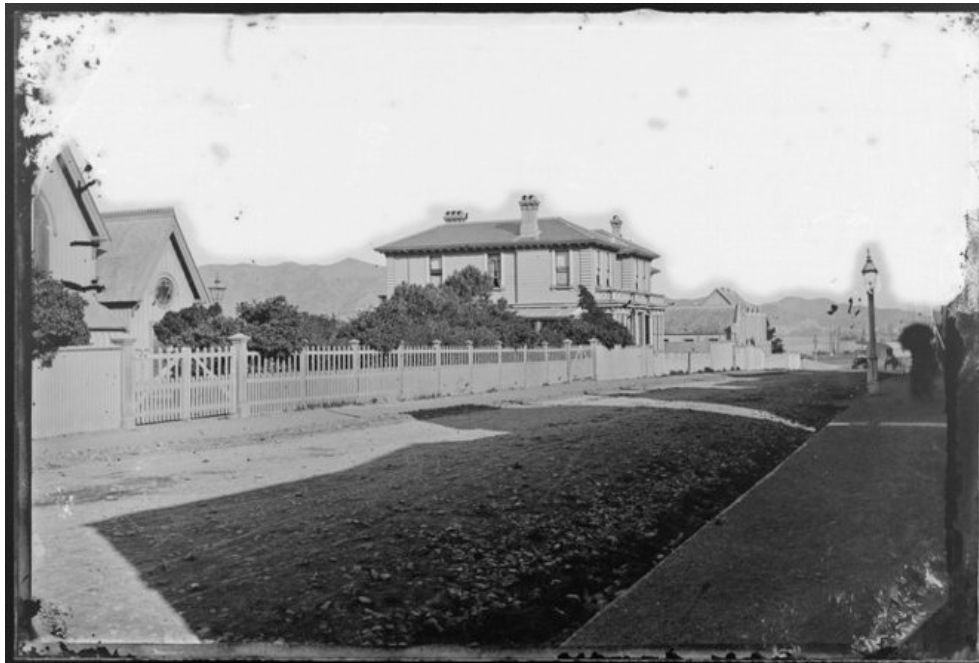
c. 1879 – 1880s The second Bishop's Court with Old St Paul's in the foreground. 9