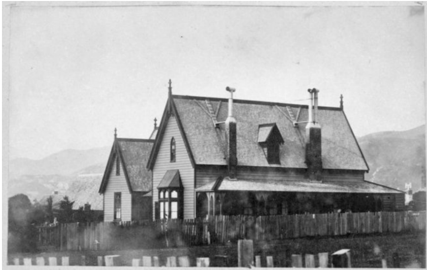
c.1860 – the original Bishop's Court 8