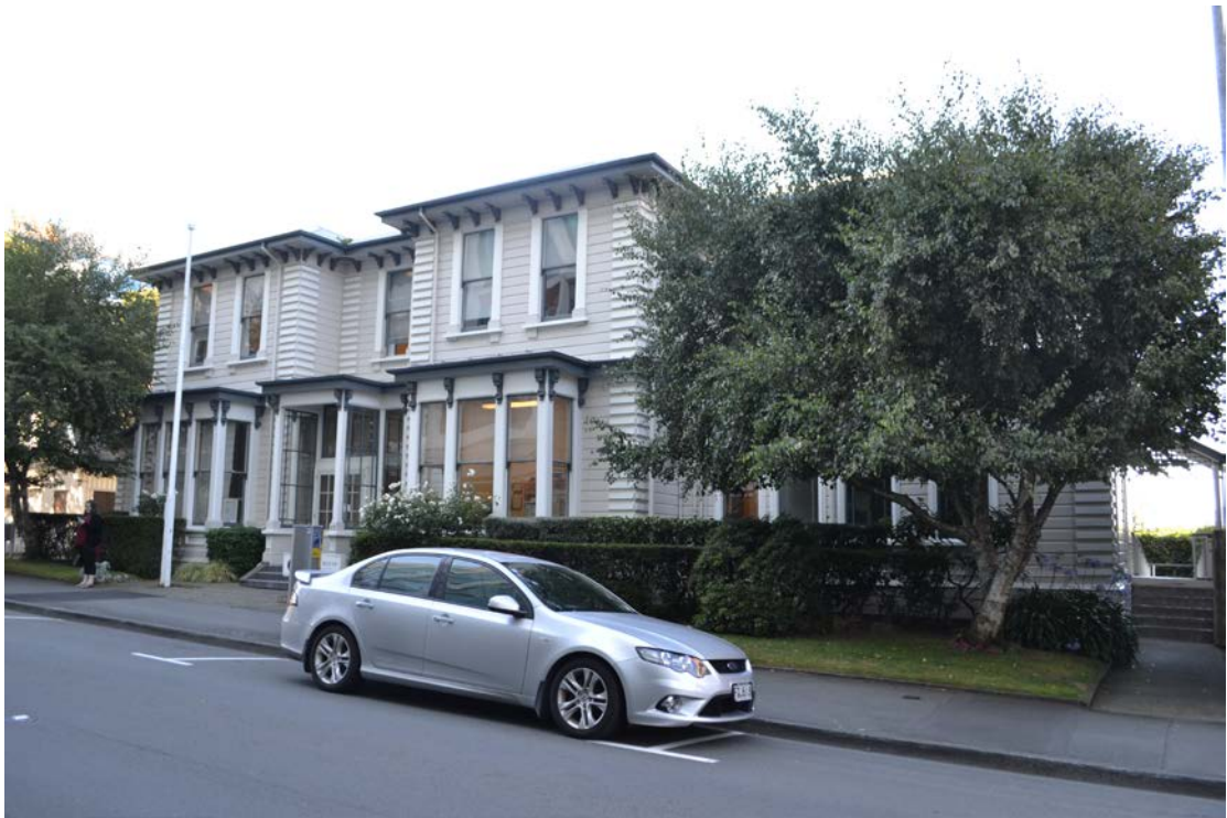
Bishopscourt, Thorndon. (Photo: Charles Collins, 2015 )