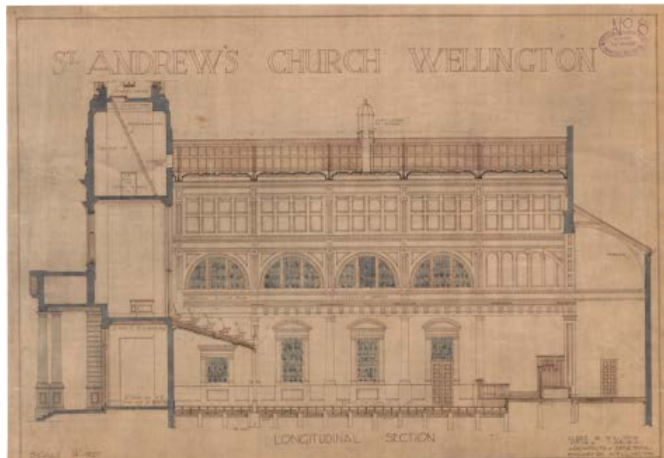
1922 Proposed section through the new church building. 11