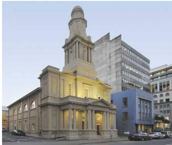
Image: 'Church for Community: St Andrew's on The Terrace', from The Resene News – Issue 2/2010, accessed 14/04/2014, http://www.resene.co.nz/archspec/products/St_Andrews.htm